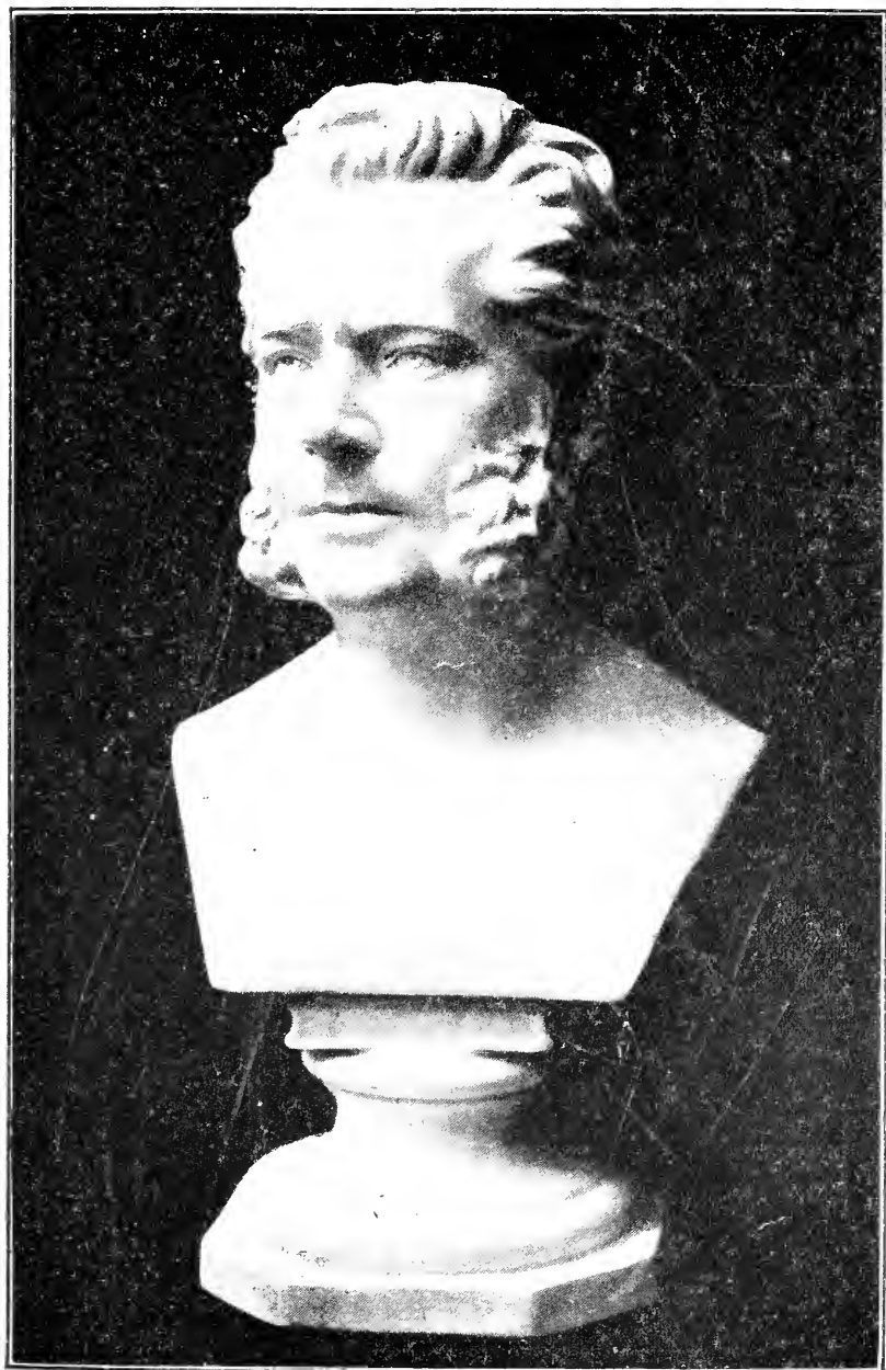
Bust of Ibsen, about 1865.